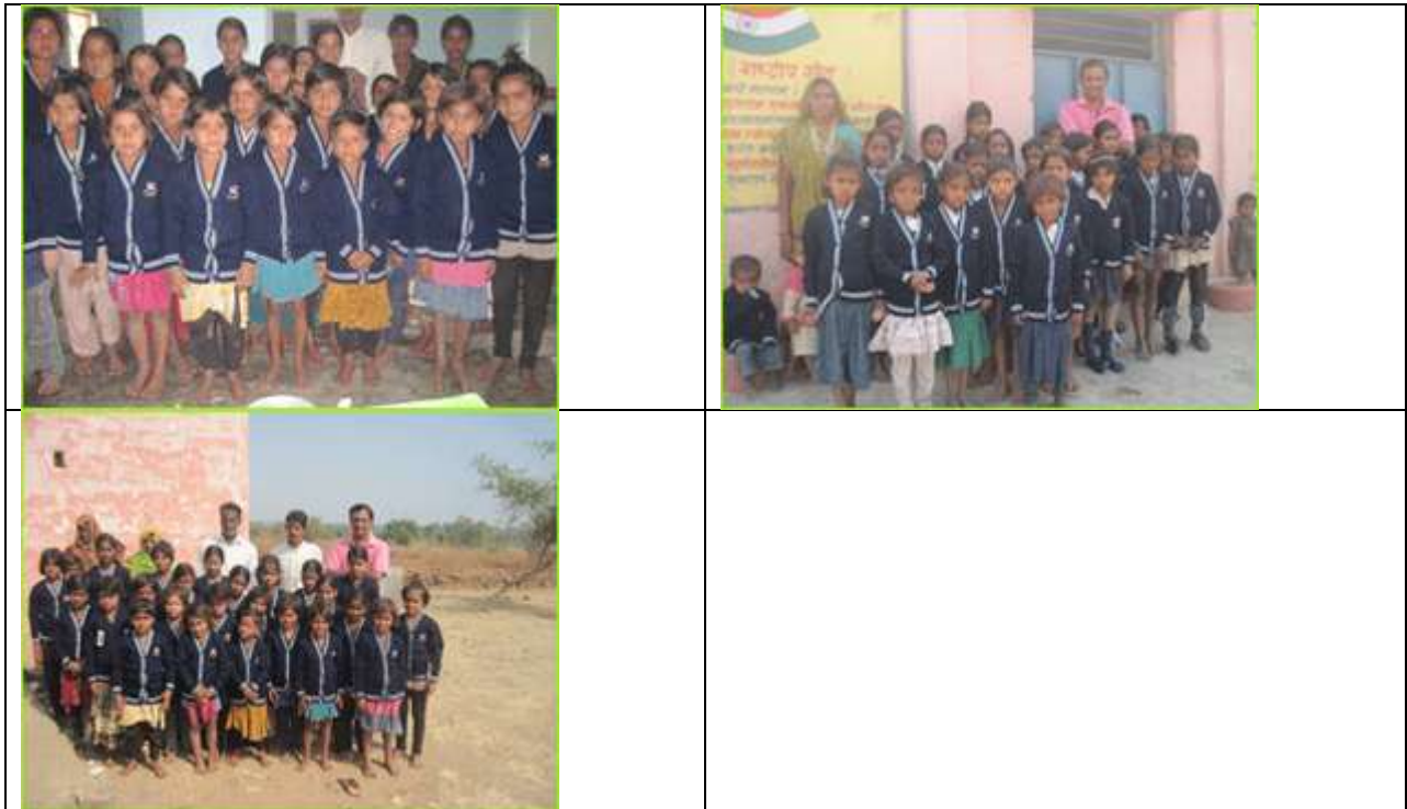
Sweater distribution in the rural areas of Bhopal: Dholiumar, Bodako